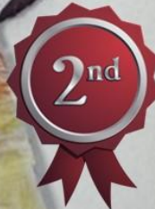
Ollie Popiela 6RM