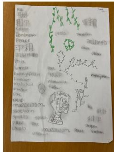
2 nd Place Kyae Dill 7MT Chocolate Bar

Please see Miss Whiteside to collect your prize