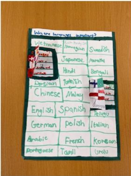
1 st Place Laila Kondej 5VP £5 Amazon Voucher

Please see Miss Whiteside to collect your prize