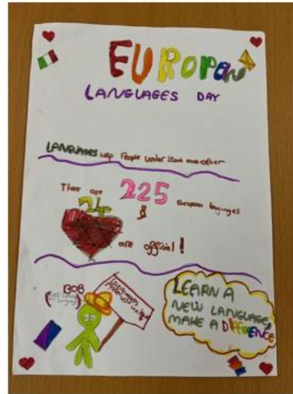
2 nd Place Emilia Sukaitis 6SH Chocolate Bar

Please see Miss Whiteside to collect your prize